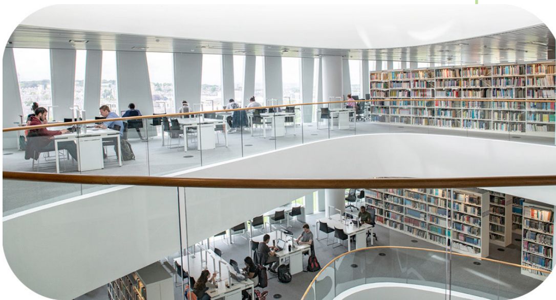
University of Aberdeen

"We are passionate advocates for the value our members deliver, leading and supporting the community to create the environment that allows them to flourish for the benefit of their stakeholders, institutions and users."