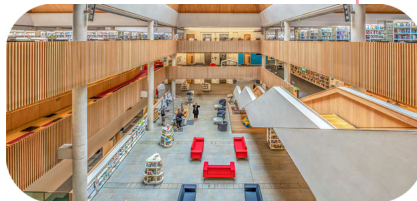
The Hive at University of Worcester