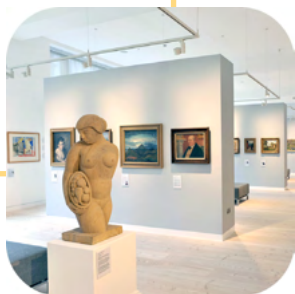
Art Gallery at University of Hull

Support innovation and the process of transformation of libraries to maximise the benefits to their institutions and their users.