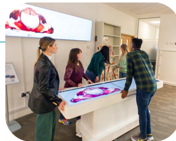
Weston Library at Bournemouth University