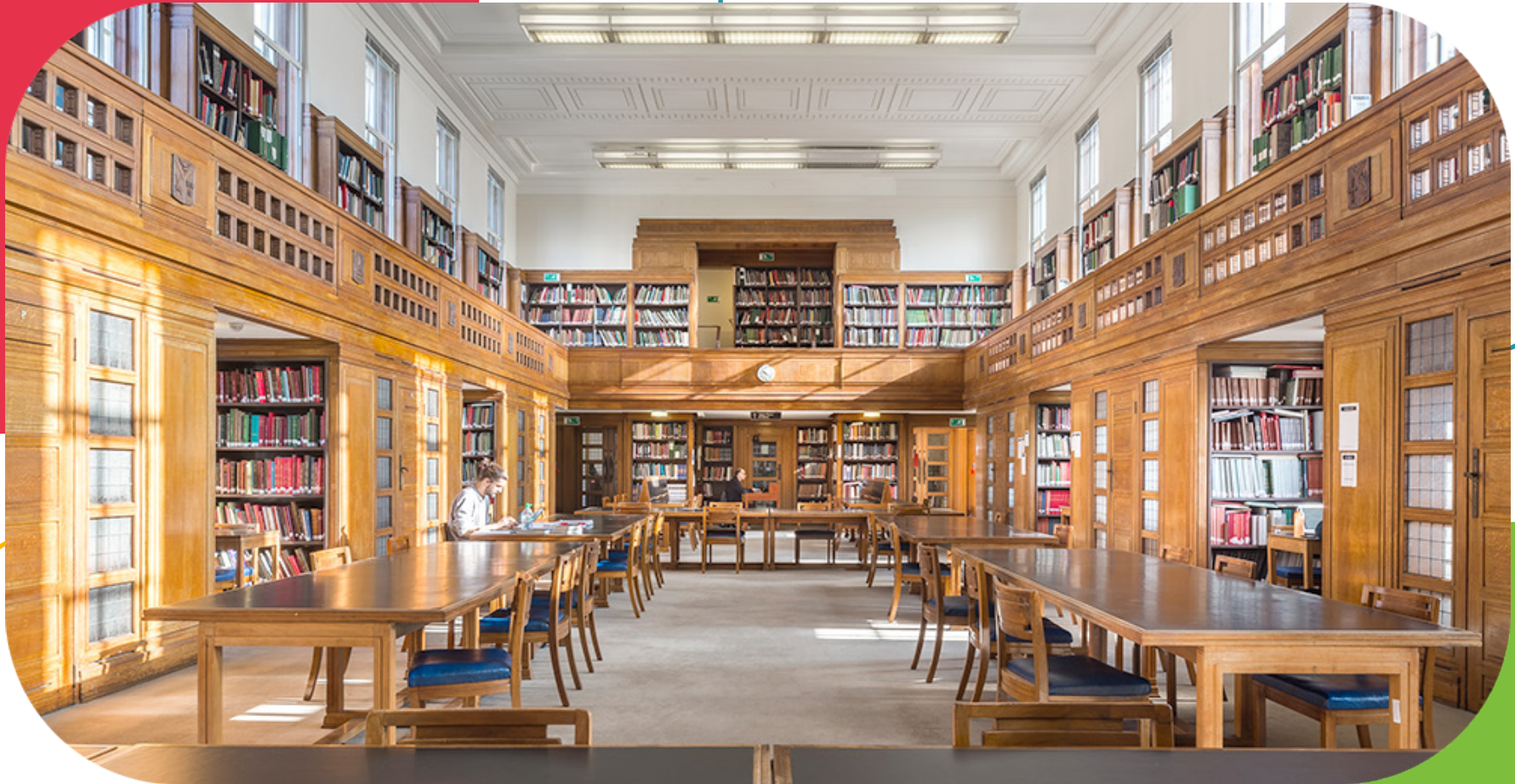
University of London, Senate House Library

94 Euston Street, London NW1 2HA +44 (0)20 7387 0317 sconul@sconul.ac.uk www.sconul.ac.uk