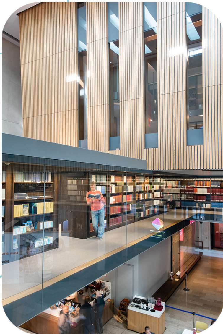
Weston Library at University of Oxford