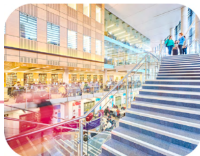
Bill Bryson Library at Durham University

Working openly, collaboratively and strategically with partner bodies within and beyond our community, locally and internationally to explore new opportunities and to deliver value for the community.