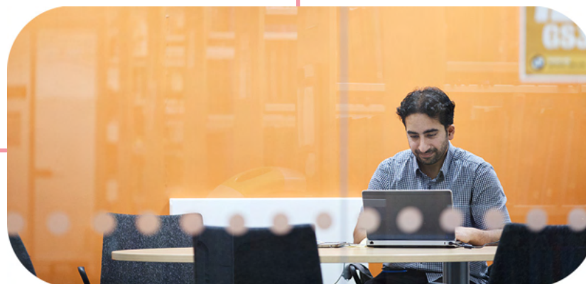
King's College London

Generating positive proposals for change and exploring new opportunities for services and partnerships to create a positive environment for our libraries and professionals to operate.