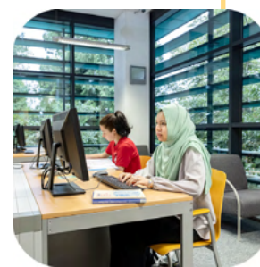
University College Cork

Support innovation and the process of transformation of libraries to maximise the benefits to their institutions and their users.