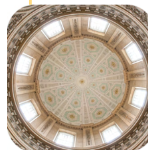
University of Oxford

Be an active agent for change, with and on behalf of our people, fostering an inclusive and diverse community and generating positive, creative solutions to sector challenges.