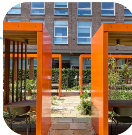
The Brett Gardens, Sydney Jones Library, University of Liverpool