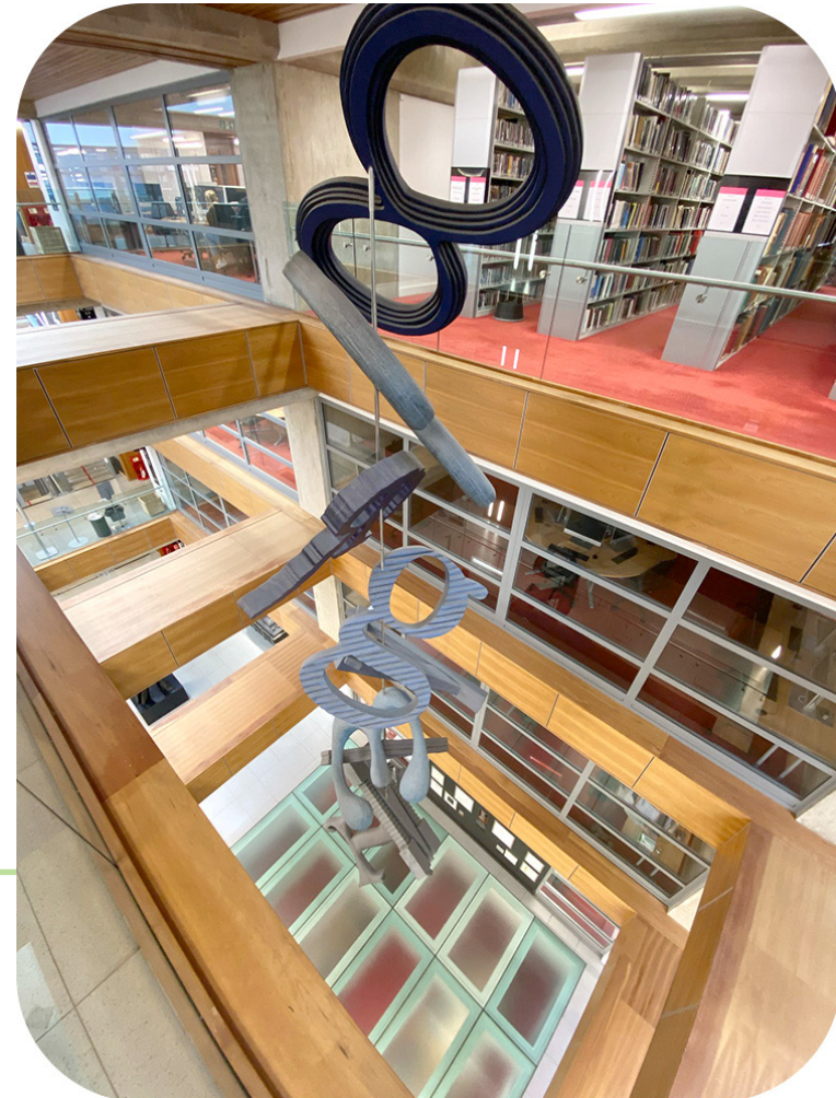
University of Leicester

"We speak for this diverse membership with a single voice on the strategic issues facing the sector"