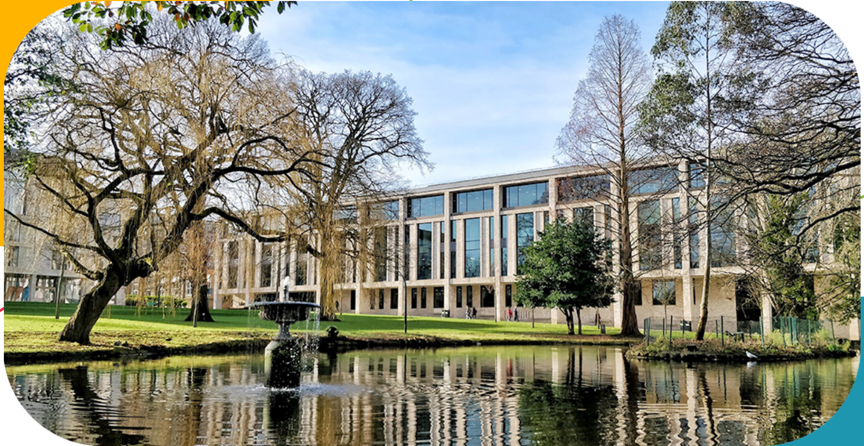
University of Roehampton