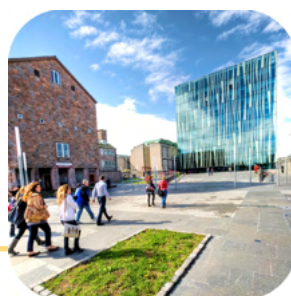
University of Aberdeen

Be agile and responsive to the developing needs of our members and the changing environment in which they operate.